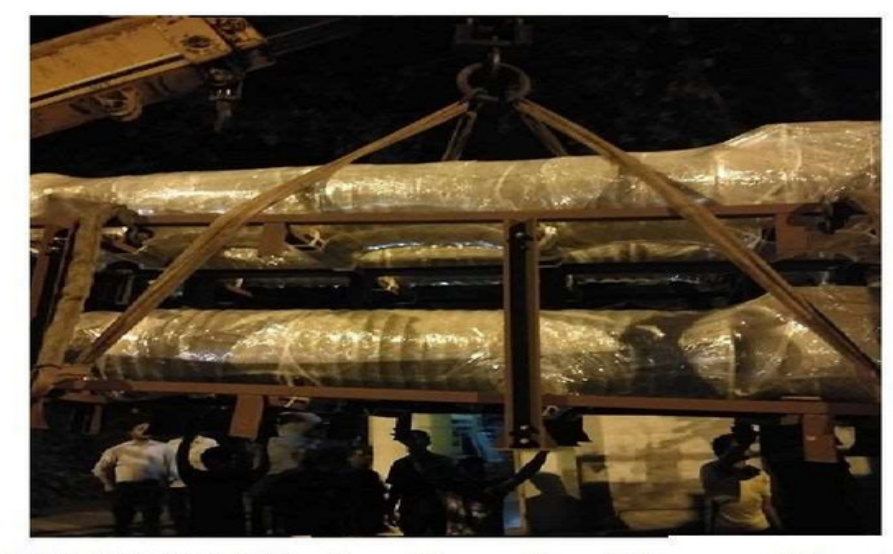
420 KV CV (Chabra Terminal Power Plant