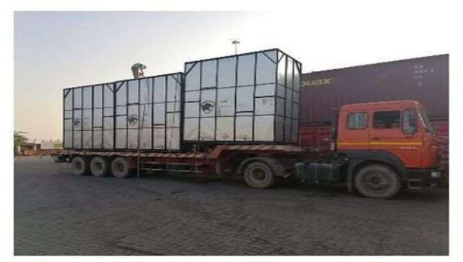
DOOSAN MACHINE TOOLS