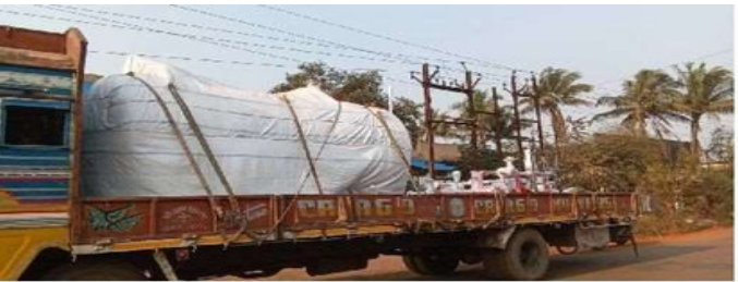
TANKER (OIL, ASSAM)