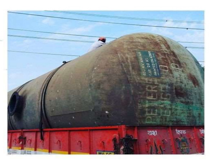
EMPTY OIL TANK, MSEB