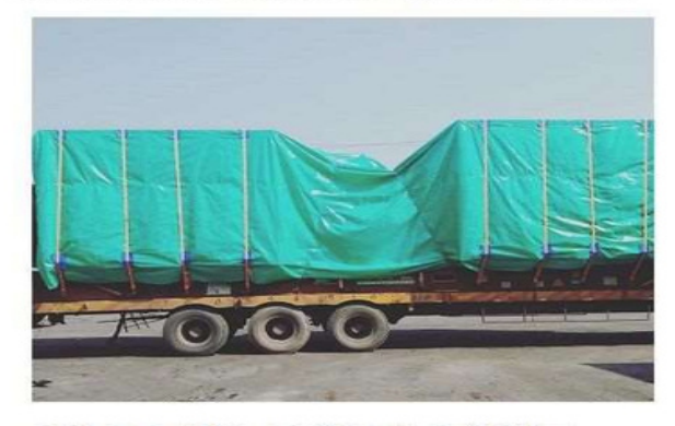
CNC DUPLEX MACHINE